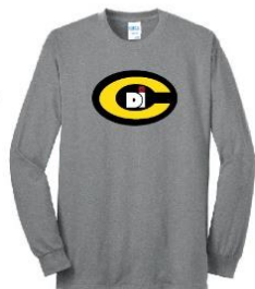
SCREEN PRINTED LOGO