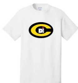
SCREEN PRINTED LOGO