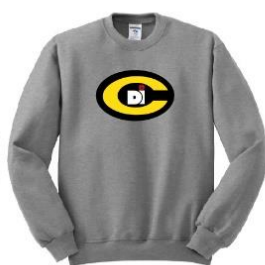
SCREEN PRINTED LOGO